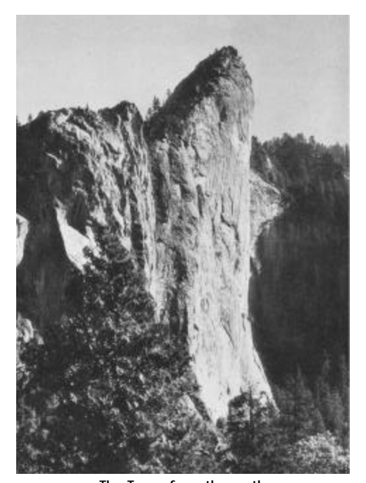
The Tower from the north

The hanging, hissing lantern cast gigantic shadows as four men racked hardware, recoiled new Perlon, and gulped down mouthfuls of cereal, milk, and blueberry pie at 4 AM in a cold, quiet Yosemite Camp 12. We had just arrived from L.A. at midnight and were only half awake after about three hours of fitful sleep. It was two days before Easter and snow on the Valley rim made sure down jackets and foot sacks were packed first in the haul bags, for two bivouacs were possible. All the gear was loaded into the VW bus and the too brief ride to the Bridalveil Falls parking lot finally convinced me that apparently nothing was going to save me from my robot madness and I was indeed committed to a "no retreat" climb on what Roper's red book called, "the most spectacular overhanging wall in the world", THE LEANING TOWER.