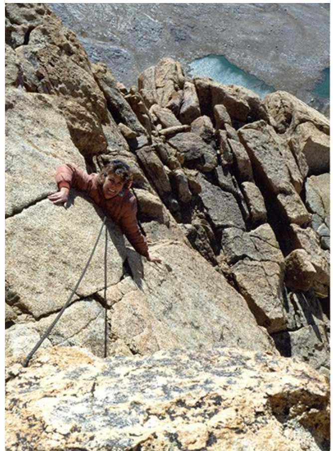
Last pitch on Mt. Humphreys