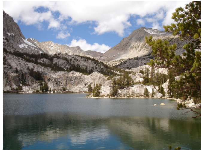
Lower Lamarck Lake