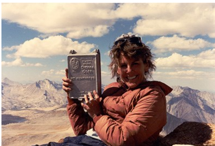
Summit of Mt. Humphreys