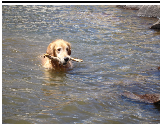
Happy canine client in Piute Lake

Enclosed is a check for the shirt and a small contribution to the foundation. Nice talking to you.